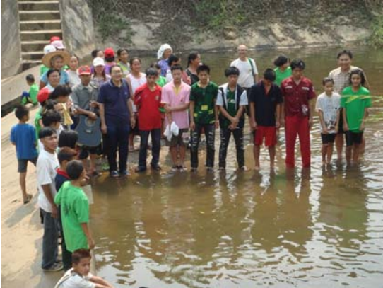
The eight people who were baptized